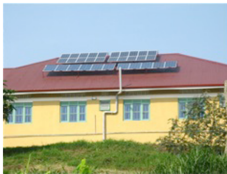
Solar panels on KIDA's new hospital building