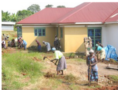
People who love KIDA came to do volunteer cleanup